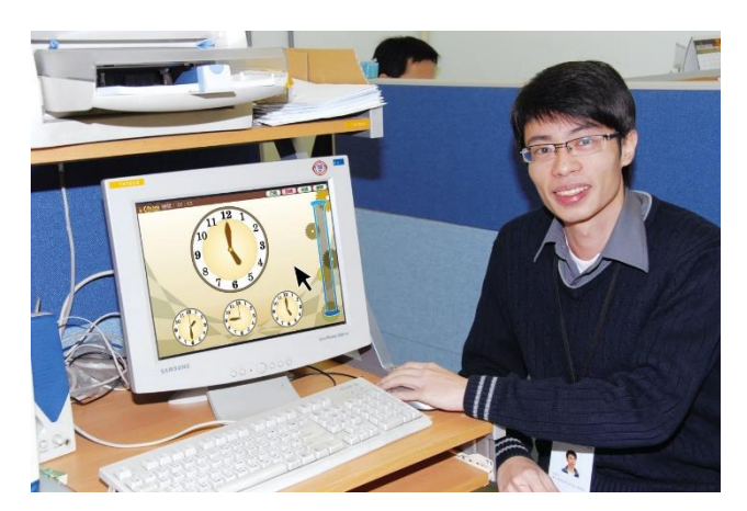
The occupational therapist demonstrates the therapeutic functions of the website.